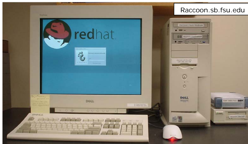
Figure 2 Data Processing Computer Raccoon.sb.fsu.edu (KLB 410A)

All XRF computers have a new domain-name, IP address and location (see Table 1 ). We have added a dual bootable laptop for synchrotron data processing and a desktop for capturing and storing digital images of the crystals. The following table shows the current details of the computers that are available to the Facility users. Note: The Windows operating system computers are under two different domains and are indicated in the parenthesis (\\DOMAIN).