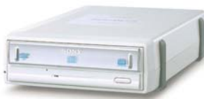
Figure 4 Sony Dual Interface Dual Media DVD Writer

For archiving (backing-up) data at home and retrieving pre-archived data from synchrotrons we have added a new multi-format (DVD \pm R/RW) dual-interface (USB 2.0 & FireWire IEEE1394) external Sony DVD DRX-510UL Writer/Reader ( Figure 4 ). This drive is capable of reading and writing all the following media: