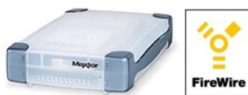
Figure 3 Maxtor FireWire External Harddrive

The data collected at the Facility is currently archived in DDS-3 and DDS-4 tapes. Earlier archives were stored in one of the following formats: 4mm DDS tapes, 8mm Exabyte tapes (mostly 8500 or 8500c), ISO 1990 CD-R, and 4mm DDS-3 tapes. In addition to the drives mentioned in Table 2 , the facility has access to DLT, ZIP-100, ZIP-250 drives. Due to random-access capability, media reliability, prolonged shelf life, and wide availability, the XRF is encouraging the users to select DVD-R media instead of tapes for future data storage and transport, even though the Facility will continue to support tape drives for several more years.