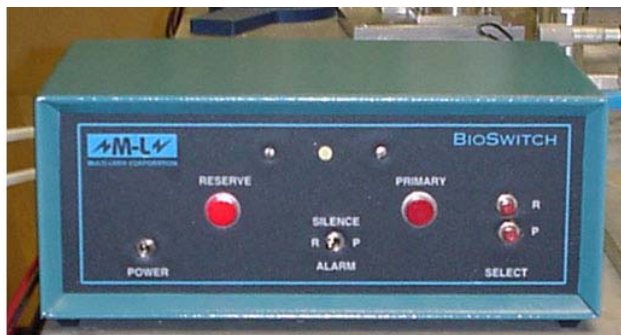
Figure 6 Bio Switch Helium Gas Cylinder Switcher

Bio Switch is an automated Helium gas cylinder tank switcher ( Figure 6 ). It has two gas inputs and pressure sensors and one gas output. The first gas input and sensor are connected to the main Helium tank (Primary) and the second sensor and gas input are connected to the second tank (Reserve). The output port is connected to several mirror systems. During the normal operation Helium is supplied from the Primary tank. However, when Helium is depleted from the Primary tank (pressure falls below 10-15 psi), Bio Switch automatically switches the supply to the Reserve tank without flow interruption. An audible alarm notifies that the switch has occurred. Status lamp indicates the identity of the supply cylinder. Depleted cylinder can be replaced at a convenient time without interrupting the gas flow.