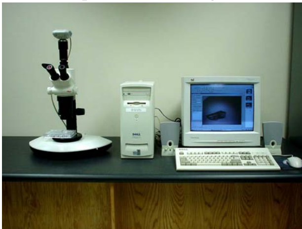
Figure5 Leica Microscope with Motic Digital Camera and Documentation Computer