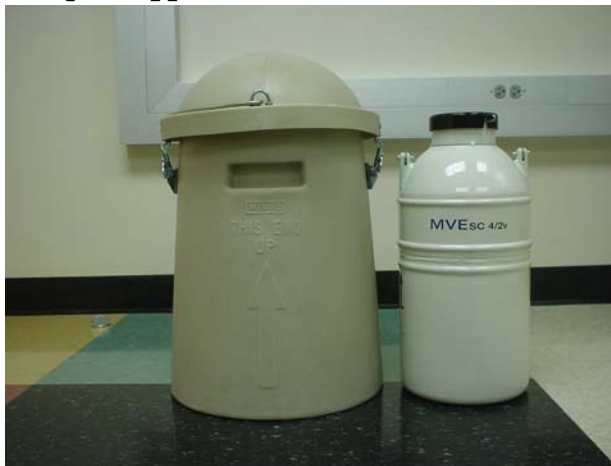
Figure 7 Chart-Biomed Cryoshipper and Shipping Container